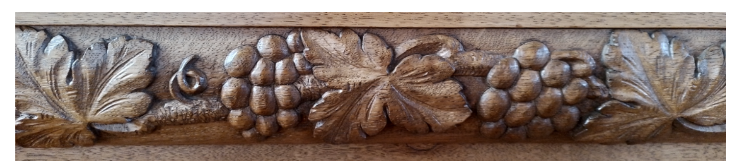
A vine - carved detail on the Knox Church communion table

I wanted to communicate this idea of a happy man without compromising our lack of knowledge of what he looked like.